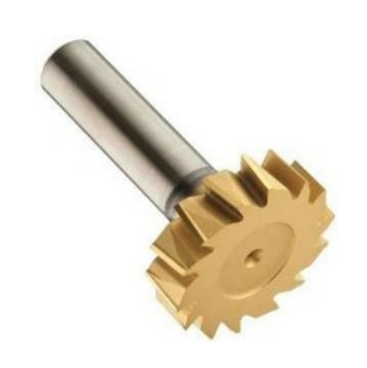
Wood Ruff Cutter