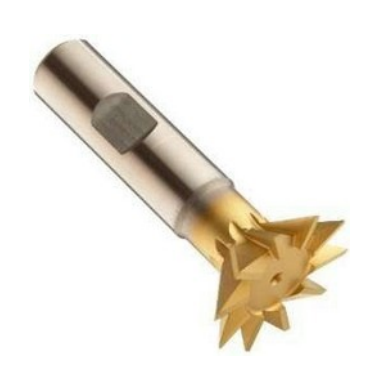
Dove Tail Cutter