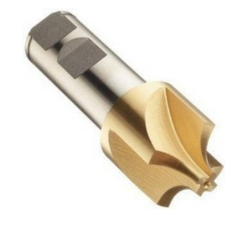
Counter Sink Cutter Corner Rounding Cutter