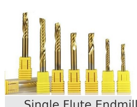
Single Flute Endmill