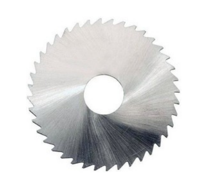
Slitting Saw Ground TeethStaggered Teeth SCCS